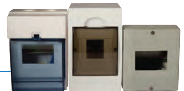
CUE5W CUE4 CUE4M