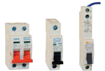
CUSW100 CUMB6 CURB32