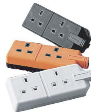
Plugs, Adaptors & Trailing Sockets